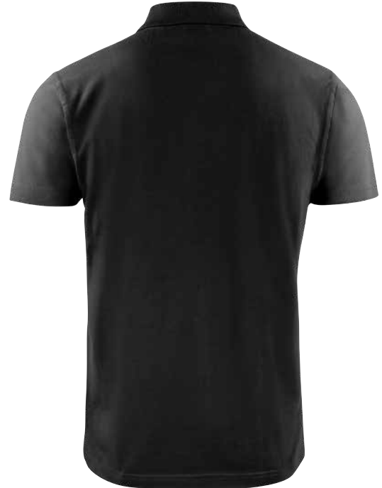
BLACK - BACK VIEW